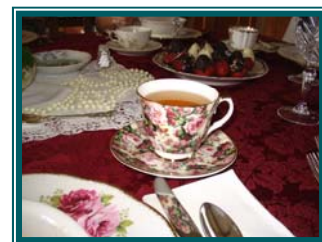
and the perfect tea....