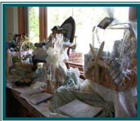
Silent Auction baskets

Foxy Horse and Hound The Chocolate Apothecary The Kitchen Engine Ferrantes